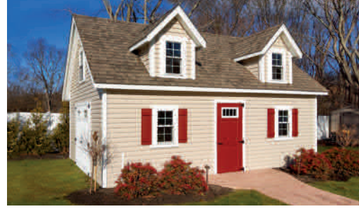
Liberty A-Frame 14'x24' Monterey Sand Vinyl Siding, White Trim, Weatherwood Shingles Options Shown: 2-4' Traditional Dormers w/ 24"x36" Windows, 3' Single Transom Door, 2-18"x27" Windows