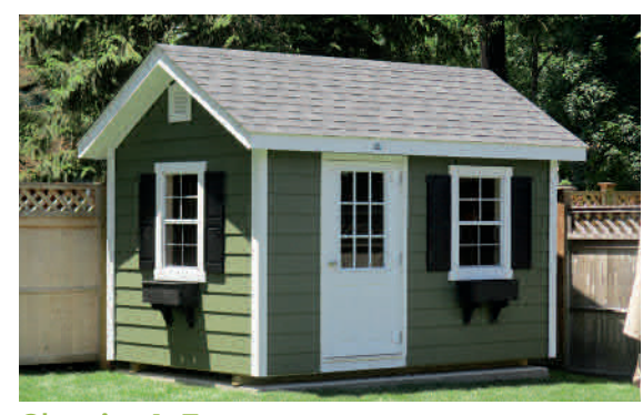
Classic A-Frame 8'x12' Mountain Sage Hardie Plank Siding, White Trim, Black Shingles Options Shown: 3' House door with 9-Lite, 24" Flower Boxes

Double Doors (Classic or Fiberglass) with 12" Hinges, 2-24"x36" Windows with Window Trim and Shutters (on 8'x12' or larger), Classic Gable Vents