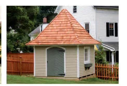
Garden Tower 14'x14' Beige LP Lap Siding, White Trim, Cedar Shake Shingles Options Shown: 4' Custom Chevron Door, Flower Boxes