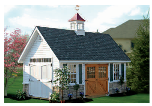
Liberty A-Frame 10'x14' White Vinyl Siding, White Trim, Harvard Slate Shingles Options Shown: - Extra 7' Pine Carriage Door, Transom Windows Above Doors, 2- Six Over Six Wood Windows (upgrade) Stone Veneer (on 2 Sides) 30" Fairfield Cupola, Copper Horse Weather vane

Large Photo: Liberty A-Frame 12'x20' with Attached 8x8 Liberty A-Frame #153 Mahogany LP Lap Siding, Clay Trim, Earthtone Cedar Shingles