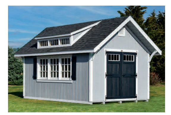
Premier Garden A-Frame 10'x16' Light Gray DuraTemp Siding, White Trim, Black Shingles Options Shown: 3 Transom Mini Shed Dormer, 5' Dbl Transom Door, Triple 9-Lite Wood Windows