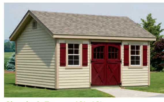
Classic A-Frame 12'X16' Beige LP Lap Siding, Clay Trim, Weatherwood Shingles Options Shown: 5' Red DuraTemp Carriage Door