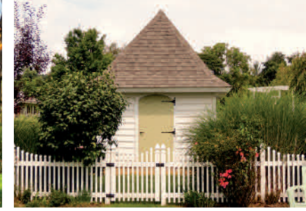
Garden Tower 12'x12' Navajo Pine Clapboard Siding, Navajo Trim, Weatherwood Shingles Options Shown: 3' Chevron Door, Flower Boxes