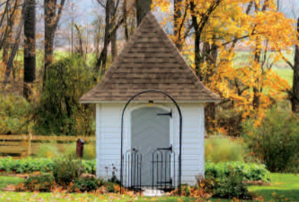
Garden Tower 10'x10' White LP Lap Siding, White Trim, Custom Color Shingles Options Shown: 3' Chevron Door