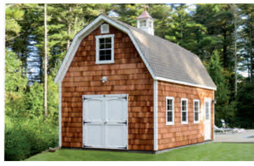
Liberty Dutch Barn 14'x24' Cedar Shake Siding, White Trim, Weatherwood Shingles Options Shown: 3-Additional 24"x36" Windows, 3' House door with 9-Lite Windows, 24" Carlisle Cupola

Double Doors (Classic or Fiberglass) with 12" Hinges, 2-24"x36" Windows with Window Trim and Shutters (on 8'x12' or larger), Classic Gable Vents