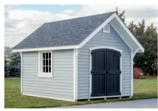
Premier Garden A-Frame 10'x12' Light Gray LP Lap Siding, White Trim, Dual Black Shingles Options Shown: LP Lap Siding, 5' Eyebrow Door Upgrade